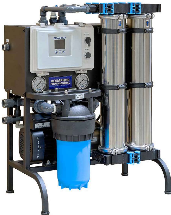
reverse osmosis system APRO 300